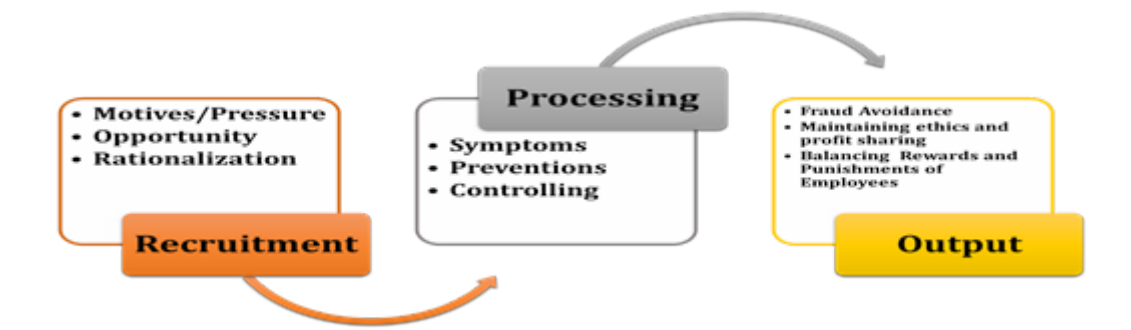
Figure 4. Simple process of fraud avoidance

The Indonesian Government has established the Financial Services Authority (FSA) but in reality only focus government bureaucracy at the central and unfair. Structural problems that occur outside of government is very difficult to execute. Even the FSA still requires a lot of personnel to be able to bear the burden and responsibility for so many organizations that are vulnerable to fraud. Thus to have a cadre of integrity begins with a good recruit. When the recruitment process is going well and the government did not make the FSA as an instrument of power, the fraud will be eliminated. All of those efforts can be expalined in the figure 4 below: