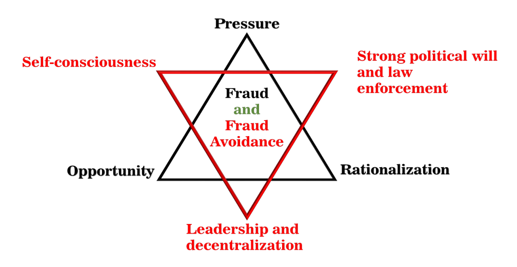
Figure 2. Conceptual framework

company management, the parties involved in governance, companies, employees, or third parties who commit deception or fraud to gain an unfair or illegal". CGMA defines "Fraud essentially involves using deception to make a personal gain dishonestly for oneself and/or create a loss for another." Thus the motivational factor can be the same, enriching himself / group and the same modus operandi, is to perform in ways that are illegal. Based on fraud triangle, the simplest way to avoid fraud by high self-consciuosness, strong political will and law enforecement, and leadership and decentralization as mentioned by figure 2 below: